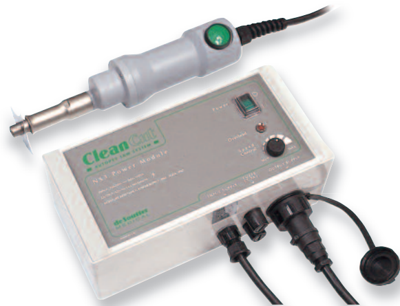
Saw and control box system complete NS3A

A rotary knob, located on the control box, allows the saw oscillating speed to be varied from zero to maximum for optimum cutting efficiency. The control box is splash proof for easy cleaning.